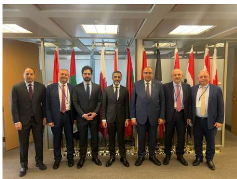
Arab Monetary Fund